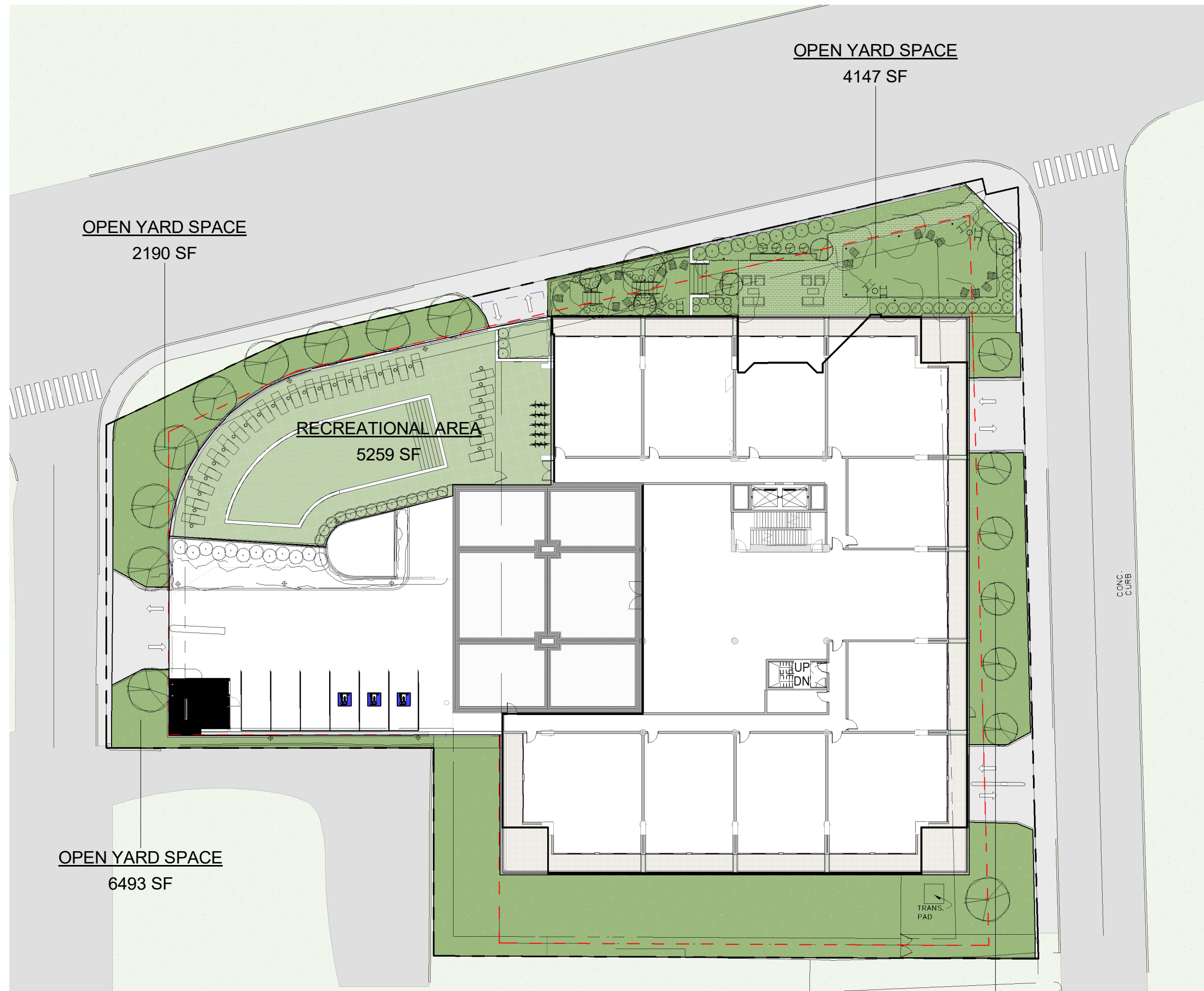
1 PARKING D SD9.02 1" = 30'-0"