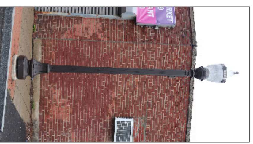
NOTE: COLOR TO BE BRONZE