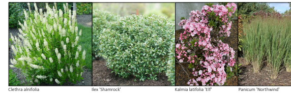
Clethra alnifolia Ilex 'Shamrock' Kalmia latifolia 'Eif' Panicum 'Northwind'