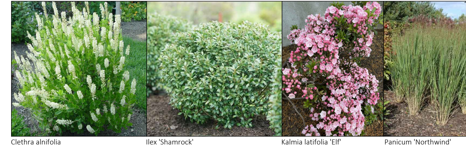
Clethra alnifolia Ilex 'Shamrock' Kalmia latifolia 'Elf' Panicum 'Northwind'