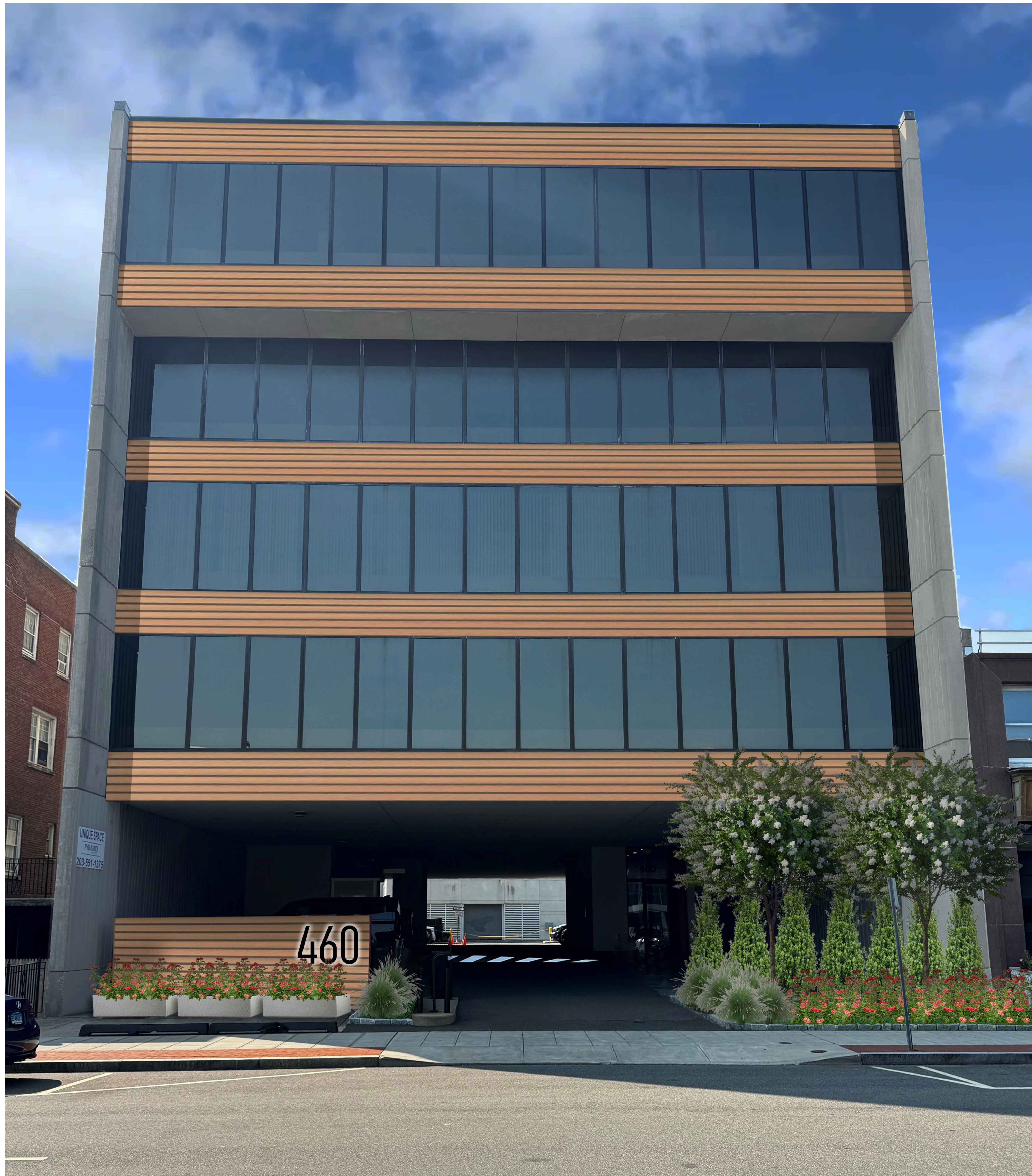
2 PROPOSED EXTERIOR ELEVATION- SUMMER ST. SCALE: NTS