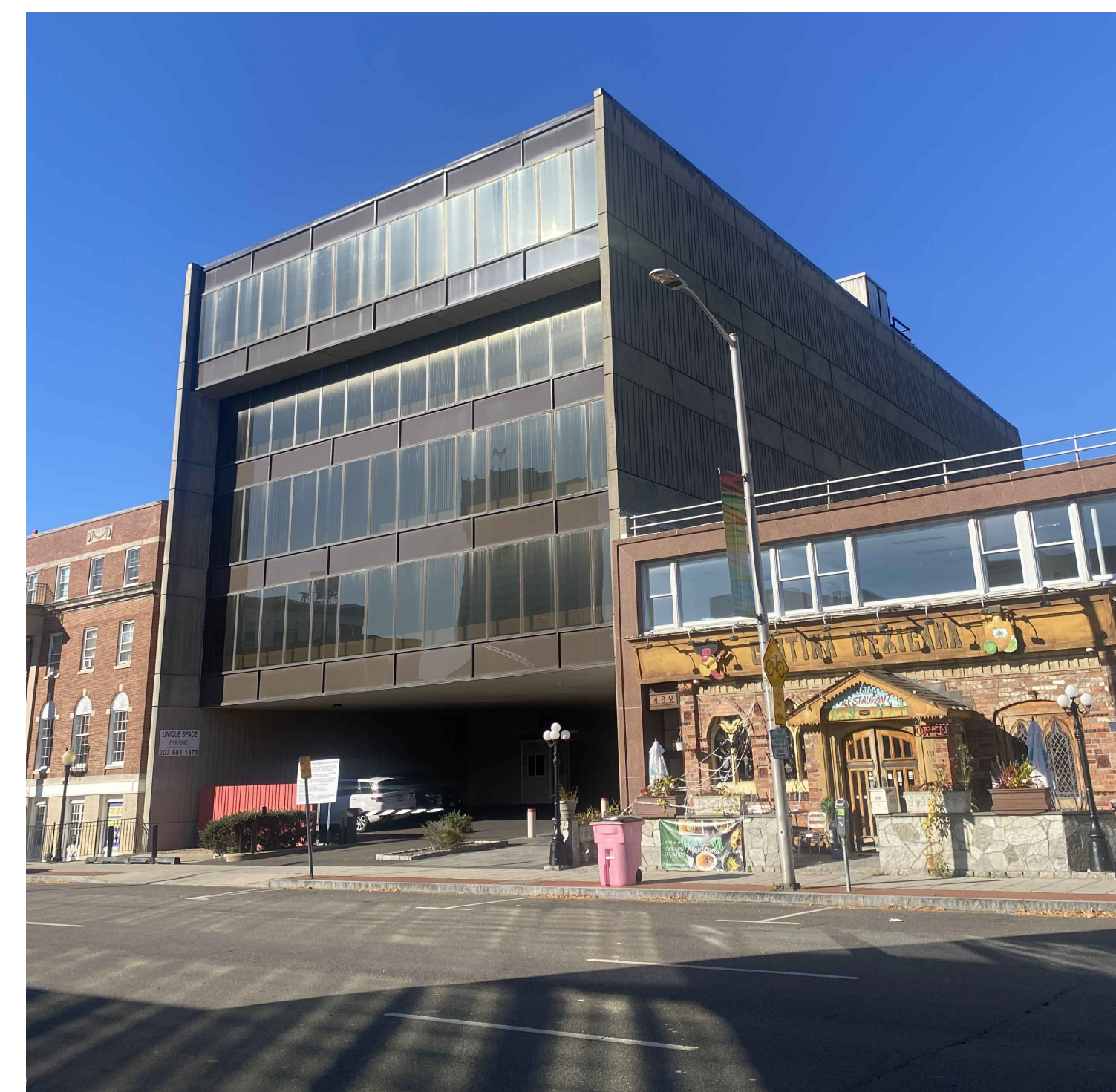
1 EXISTING CONDITIONS SCALE: NTS

PROJECT: 460 SUMMER ST 460 SUMMER STREET STAMFORD, CT 06901