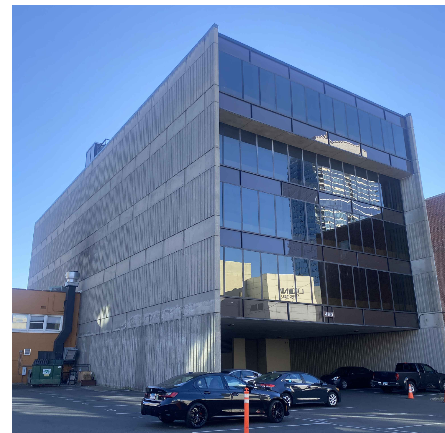
1 EXISTING CONDITIONS SCALE: NTS