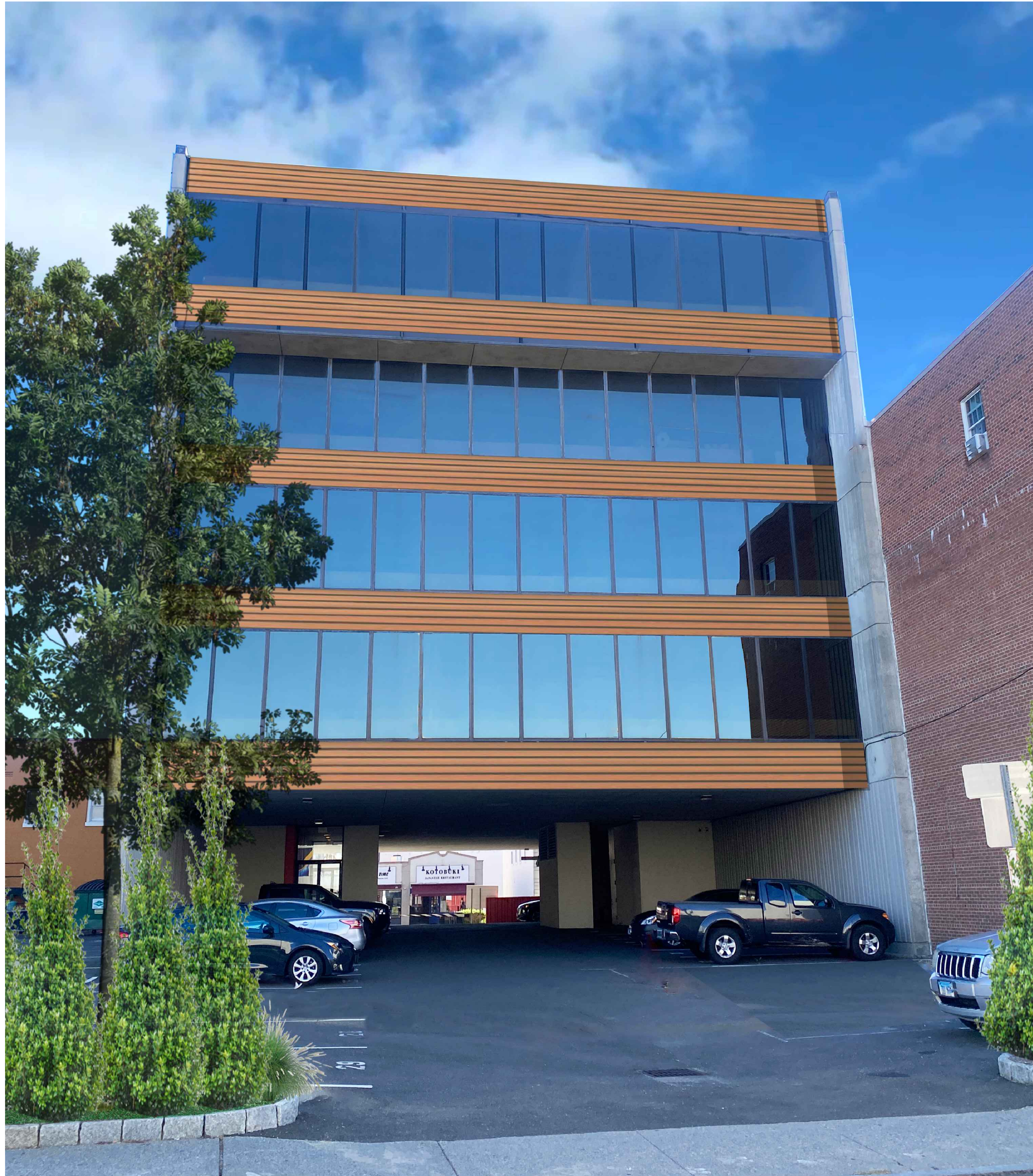
2 PROPOSED EXTERIOR ELEVATION- FRANKLIN ST SCALE: NTS