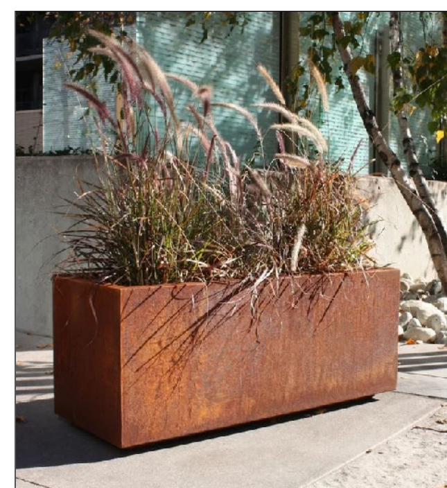
PLANTER: 25" WIDE, 11" DEPTH, 13" HT.